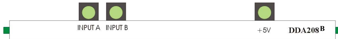
DDA208B front edge view

The front edge of the DDA208B card provides power rail monitoring and signal status.